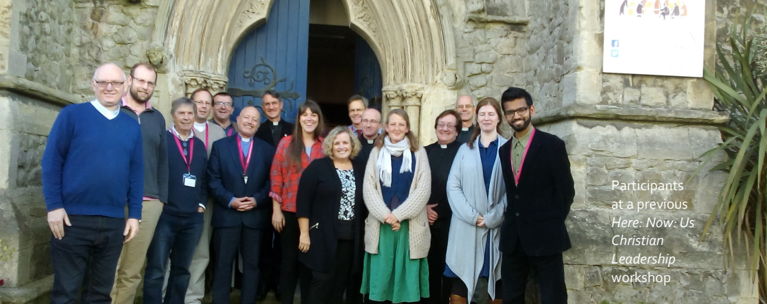
Participants at a previous Here: Now: Us Christian Leadership workshop